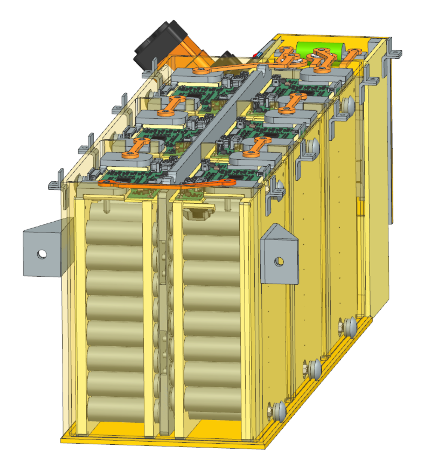
Figure 2: Container view showing how the stacks are positioned.