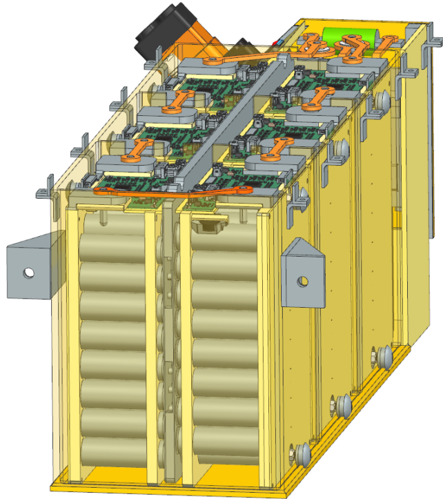
Figure 2: Container view showing how the stacks are positioned.